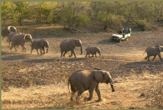
Mashatu Game Reserve