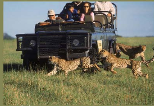
MalaMala Game Reserve